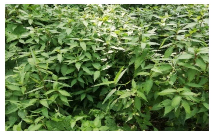
Figure 2.1: The fresh leaves of Polygonum minus (P. minus)

The fresh leaves Polygonum minus ( P. minus ) were collected from Kuala Kangsar, Perak. The soxhlet extraction method were performed on dried and pulverised leaf sample by utilising 6L of methanol at the temperature within 50^{\circ} C - 60^{\circ} C for 20 hours. Later, extracts were dried using rotary evaporator at the pressure of 80 -100 mbar.